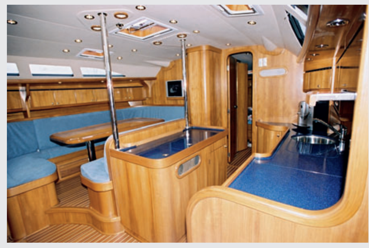
Spacious salon and large dining table, comfortable seating