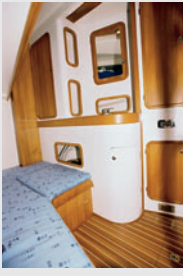
Big size Skipper cabin (2 beds)