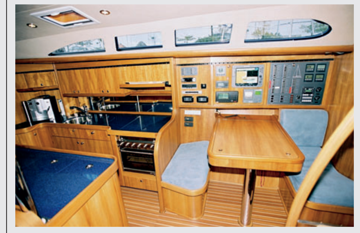
Big and comfortable pantry with large fridge and freezer volumes